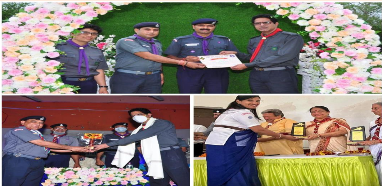
Receiving Awards for Best performance in Rovers and Rangers