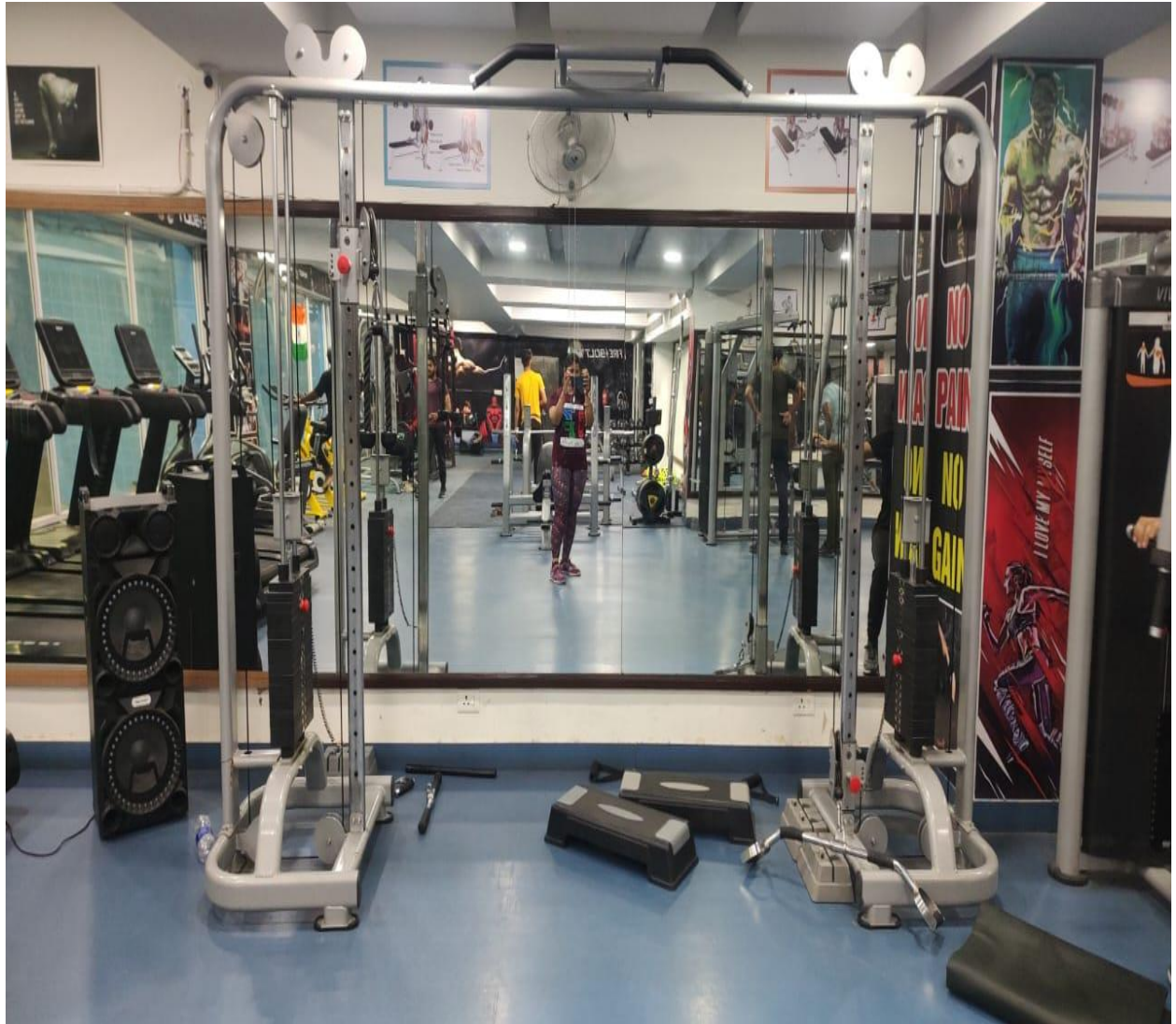
7.2.2(c) Assisted Pull up