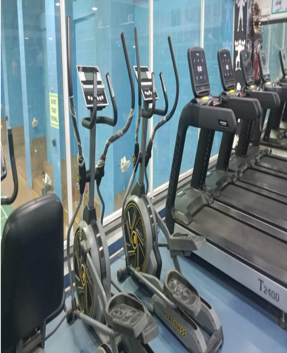
7.2.2(c) Cross trainer