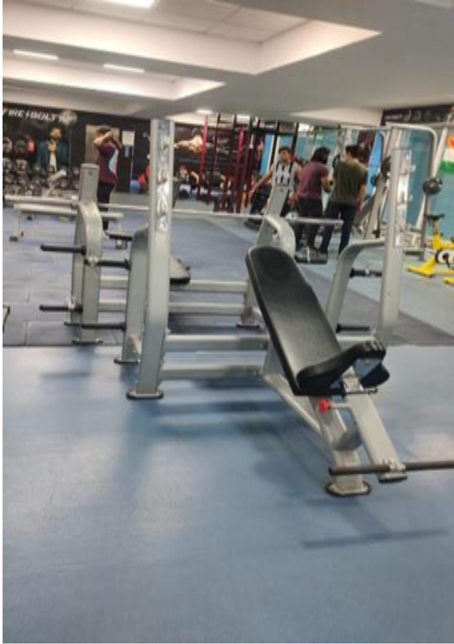
7.2.2(c) Flat and Inc Bench