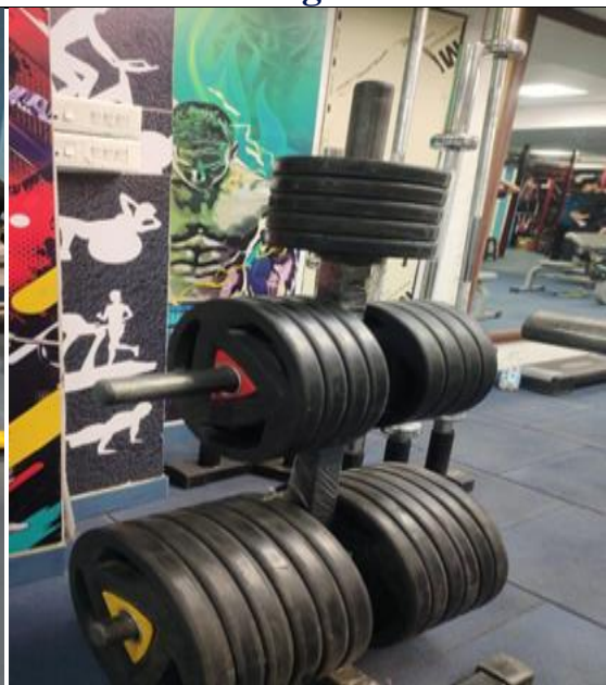
7.2.2 (c) Weights