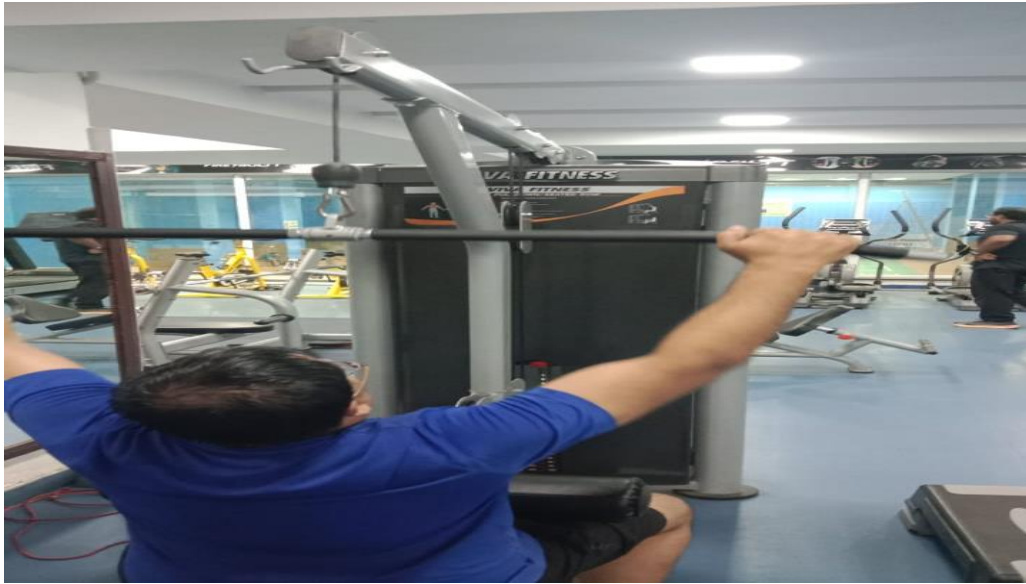
7.2.2(c) Pulled down and seated Row