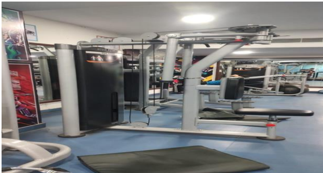
7.2.2(c) Assisted Pull up